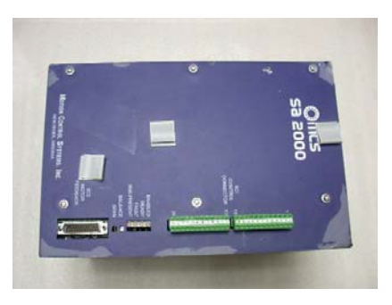
GSD 200E2 Motor ampfilier