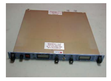
EMS Power Supply