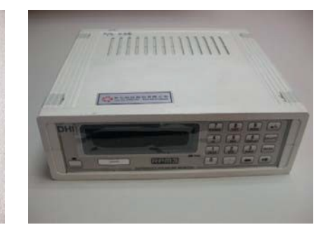
RPM3 Repair and Calibration