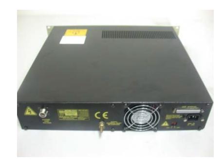
G2 Power Supply ,Quantum/Quantum III