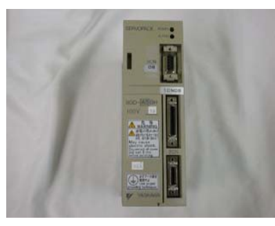
Yaskawa Motor Driver Repair