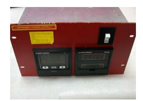
Vaporizer Power Supply E-500