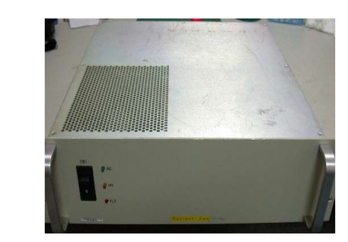
Extration PSU Viista810