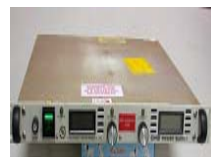
Fialment PSU Viision