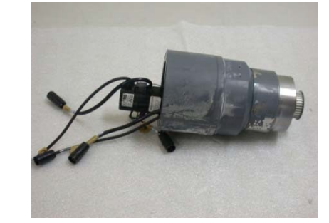
Pad Conditioning Base Assembly Repair