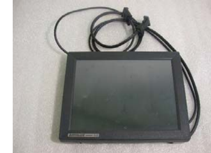
S12 Touch Panel Repair