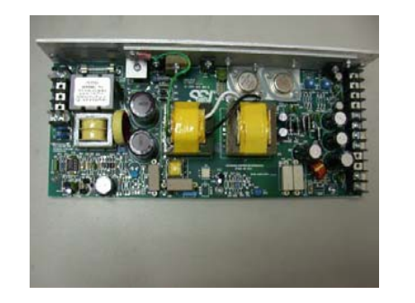
Power Supply Repair