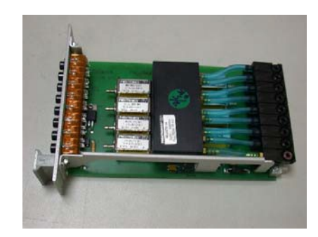
Air Valve Repair